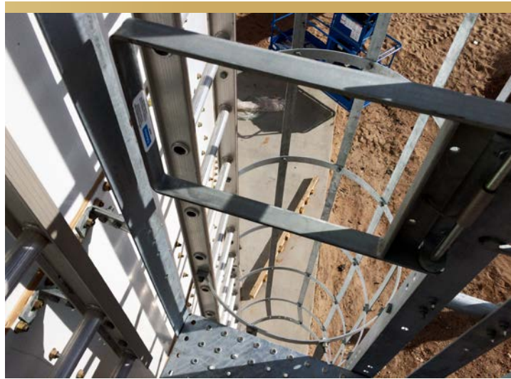
» Safety Gate

For more information about upgrading your ladders to the new OSHA regulations for 2018, call the experts at 844-44-TANKS or visit us online at cstindustries.com .