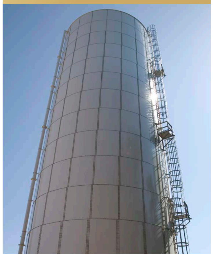
» Multiple Ladder Runs Shown on Epoxy Coated Tank