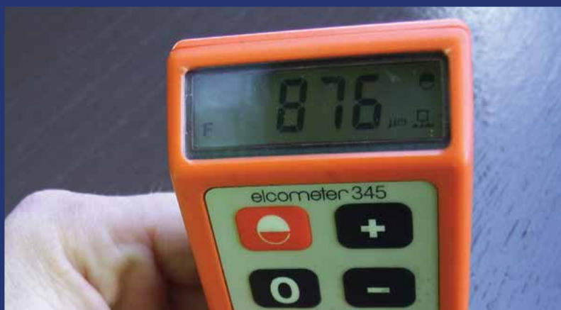
UTM results given in microns