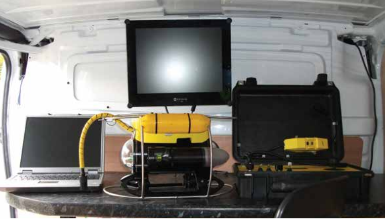
ROV inspection equipment