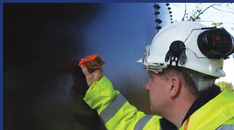
Undertaking a UTM inspection