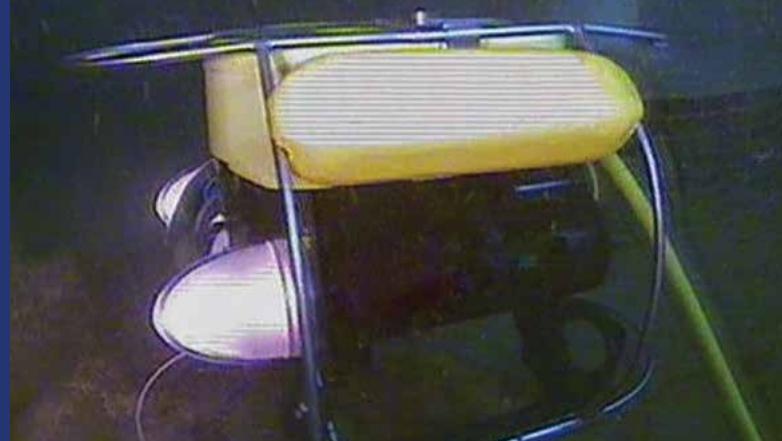
ROV navigating around the tank