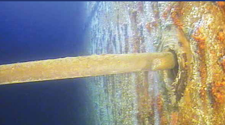
Corrosion discovered on tank panel