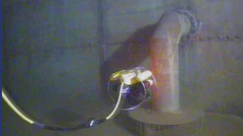
ROV inspecting ancillary items